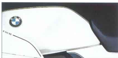
K100 RS 650, Mother-of-pearl white/ Bermuda blue metallic

Ergonomically arranged switches designated additionally by colors and ISO symbols. Adjustable handlebar with vibration-insulated mount (K100-Series and K1). One key for ignition, seat, fuel tank and handlebar lock. Folding double seat, storage compartment at the rear. 16-piece toolkit, repair kit with gas cartridges for pumping up tyres. Jack-up system. Two rearview mirrors, adjustable. Electric socket. Digital clock.