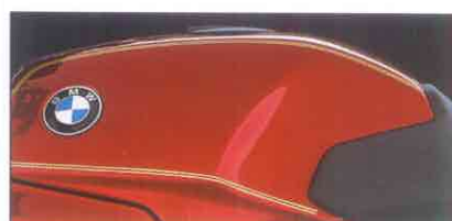
K75 654, Red metallic