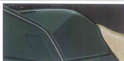
K100 LT 653, Toscana green metallic