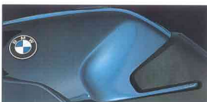
K1 657, Laguna blue metallic