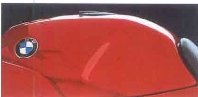
K75 S 643, Marakech red