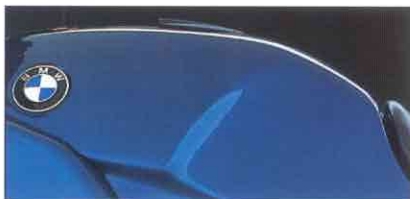
K75 S 664, Titan blue metallic