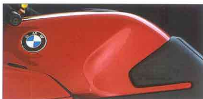
K1 658, Marakech red