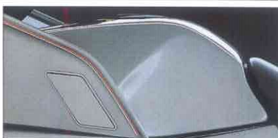
K100 LT 655, Stratos grey metallic