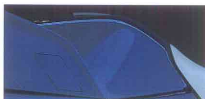
K75 RT 645, Bermuda blue metallic